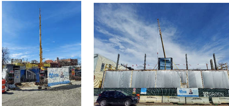
March 2023 construction progress