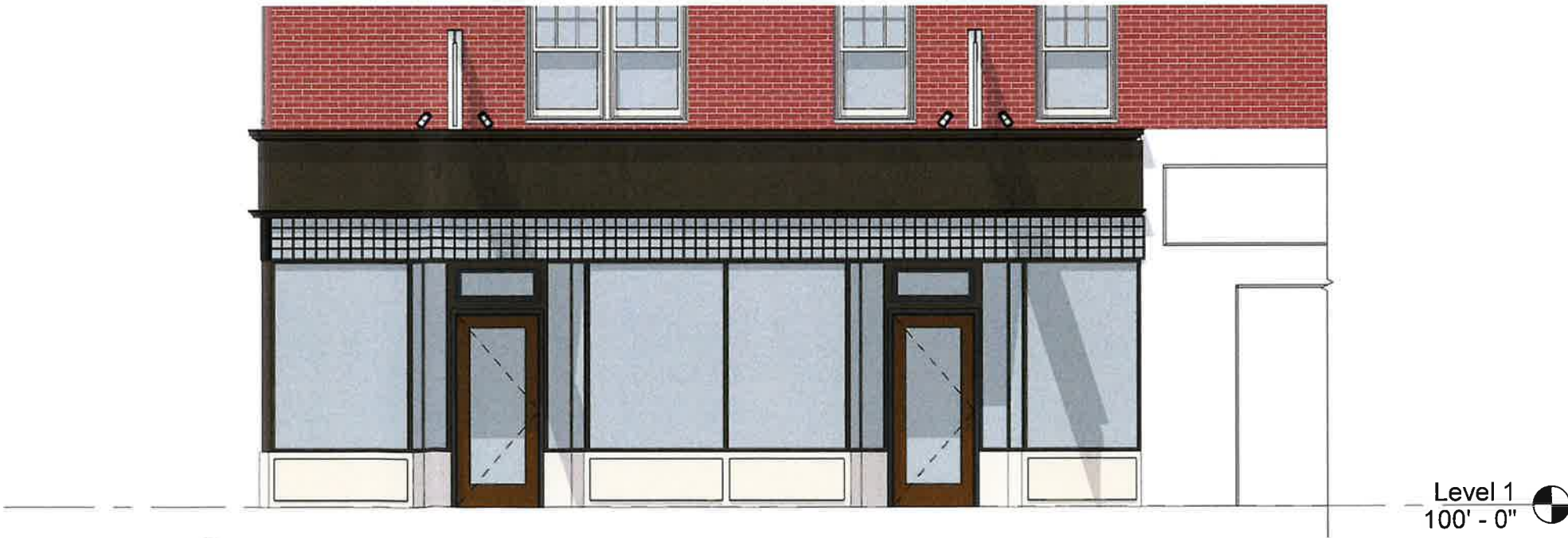
2 WAKEFIELD STREET ELEVATION - OPTION 2 3/16" = 1'-0"