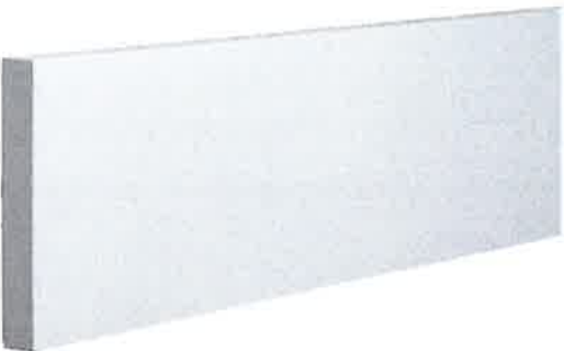
AZEK PVC TRIM