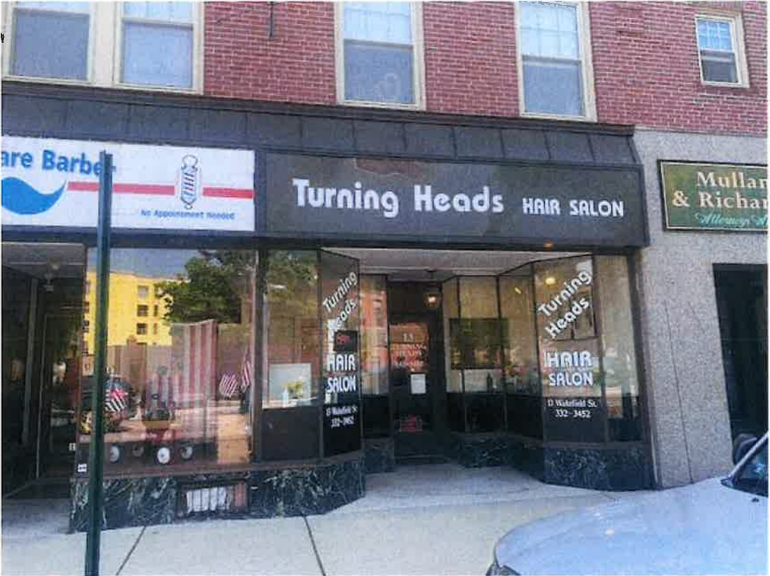
PHOTOGRAPHS FROM WAKEFIELD STREET- OPTION 2: COMPOSITE TO MATCH COLOR OF EXISTING WINDOW TRIM