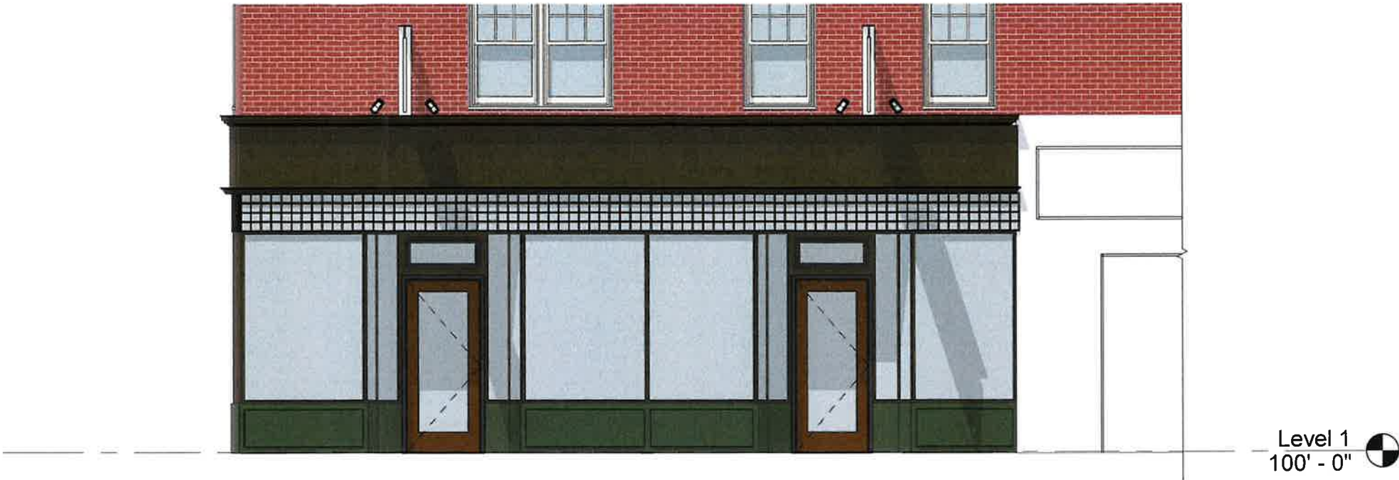
1 WAKEFIELD STREET ELEVATION - OPTION 1 3/16" = 1'-0"