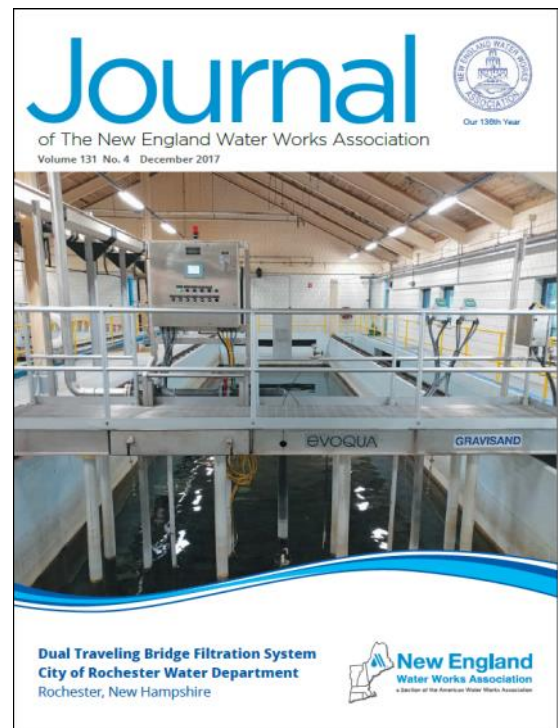
Reprinted from the Journal of NEWWA, Vol. 131 (No. 4) by permission. Copyright © 2017 The New England Water Works Association.