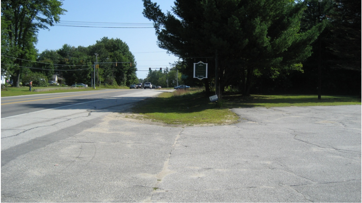
Photo 5 - Existing site entrance and parking - Highland Street in left side of photo