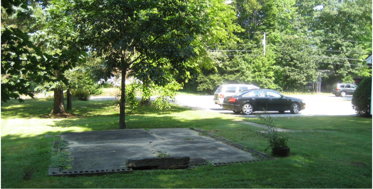
Photo 9 - Existing concrete pad to be removed and replaced with loam and seed