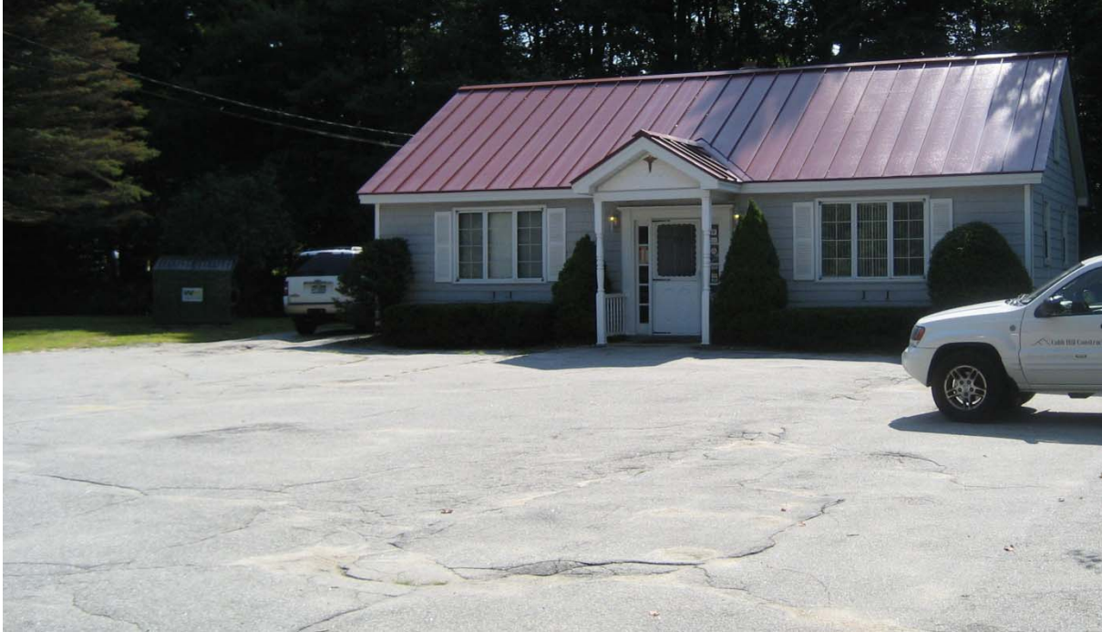
Photo 1 - Existing building entrance - shown from Highland Street