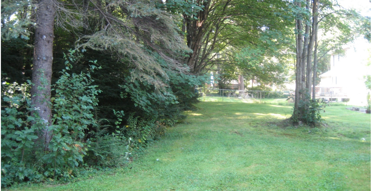
Photo 7 - Existing landscaping along the rear property line - Residential Abutters (facing west)