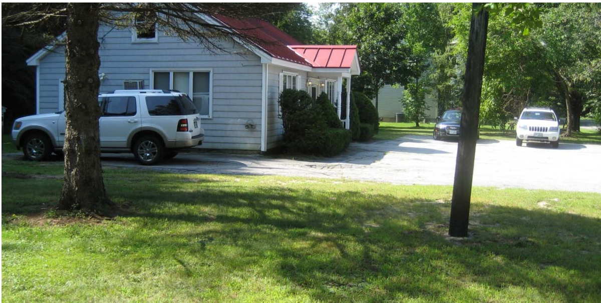
Photo 2 - Existing building face - north east side