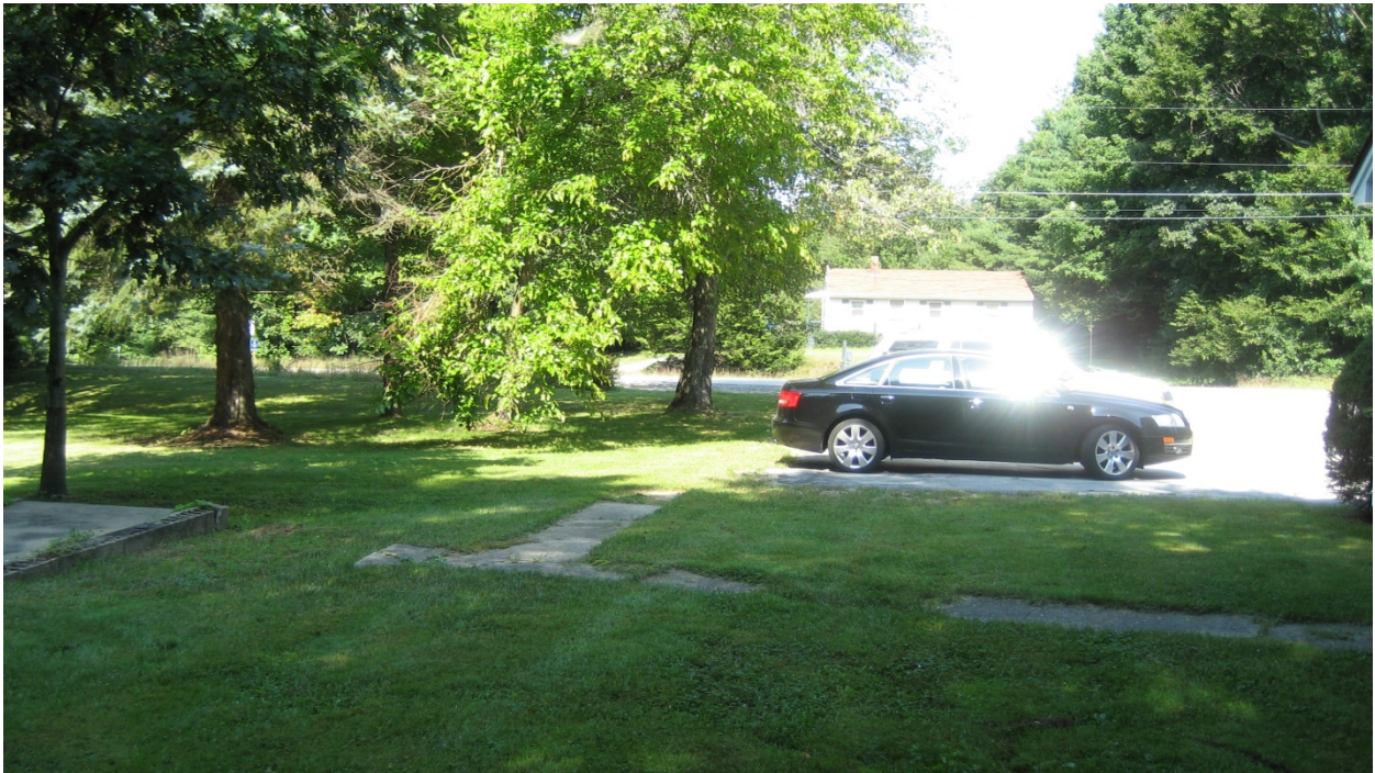
Photo 10 - Existing concrete walk to be removed.