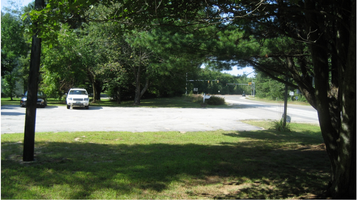
Photo 3 - Existing site entrance and parking - Highland Street in right side of photo