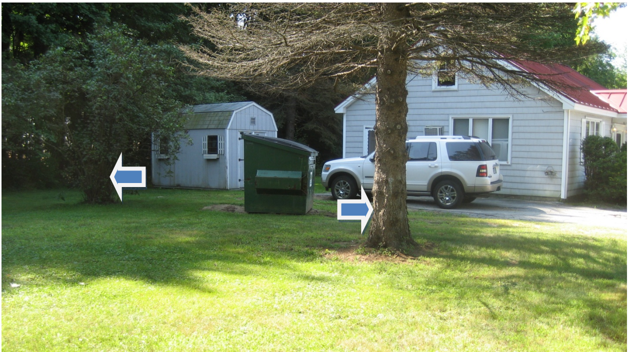
Photo 6 - Existing trees located within the proposed building footprint to be removed