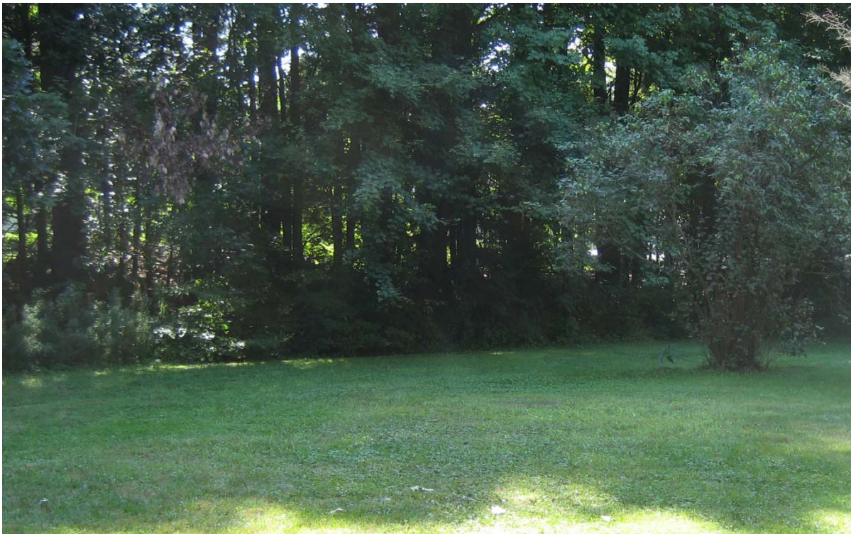
Photo 8 - Existing landscaping along the rear property line - Residential Abutters (facing south)