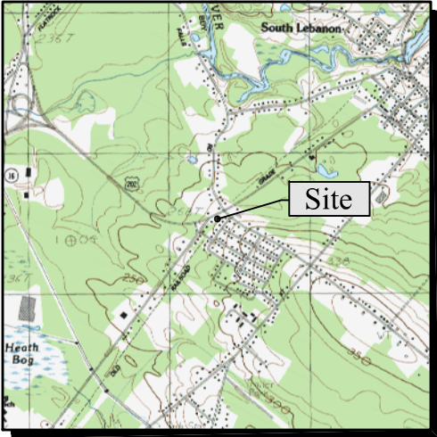
Site Location Map