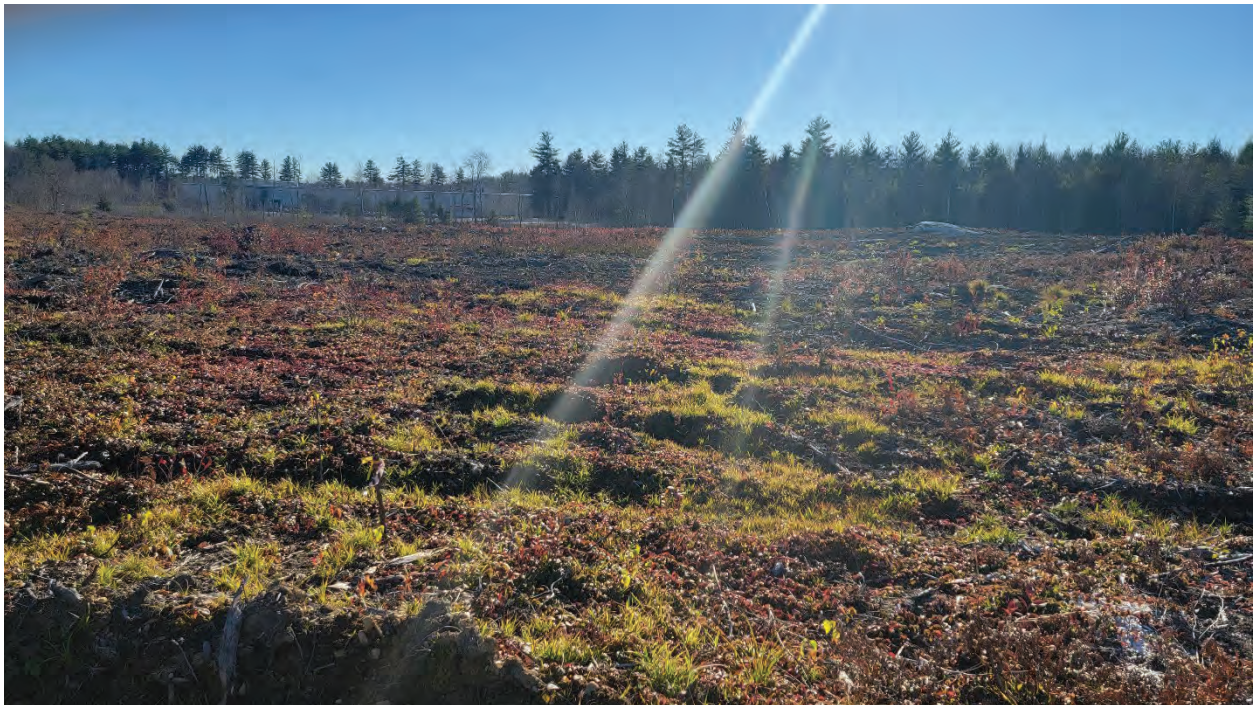
Photo 9 – Wetland Restoration Area #1 – Additional view of disturbance near end of Wetland B in the center of the property (Map 240, Lot 49) (photo taken 11/10/22).