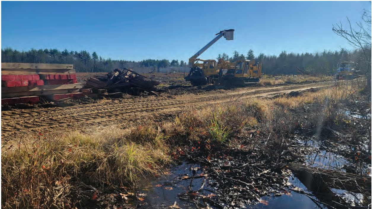
Photo 1 – Wetland Restoration Area #1 – View southeast from the west side of Shaw Drive in Wetland B and along Wetland Restoration Area #1, which proposes restoration work along Shaw Drive and within Wetland B on the property (Map 240, Lot 49) (photo taken 11/10/22).

This Wetland Restoration Plan was prepared for impacted wetlands located off of Shaw Drive in the Town of Rochester, NH (Map 240, Lot 49 and Map 240, ROW). The project area includes 2 areas of wetland which have been impacted without a permit for forestry work (NHDES File No. 2022-00571). Wetland restoration area #1 is located in the middle of the site in Wetland B where the wetland has been impacted during forestry activity and impacted by the installation of Shaw Drive. Wetland restoration area #2 is located in the southwest of the site in Wetland C which has been impacted during forestry activity and along Shaw Drive. Total proposed wetland restoration area is 135,379 sq. ft. (3.1 Acres). Restoration is divided into two areas (Restoration Area #1 and Restoration Area #2). Detailed descriptions of the restoration activities follow.