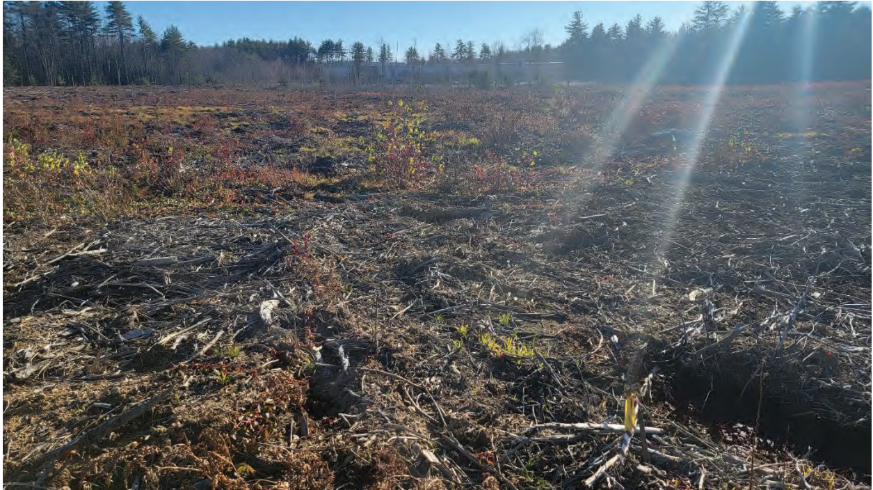
Photo 10 – Wetland Restoration Area #1 – Additional view south across Wetland B which requires a large area of restoration (photo taken 11/10/22).