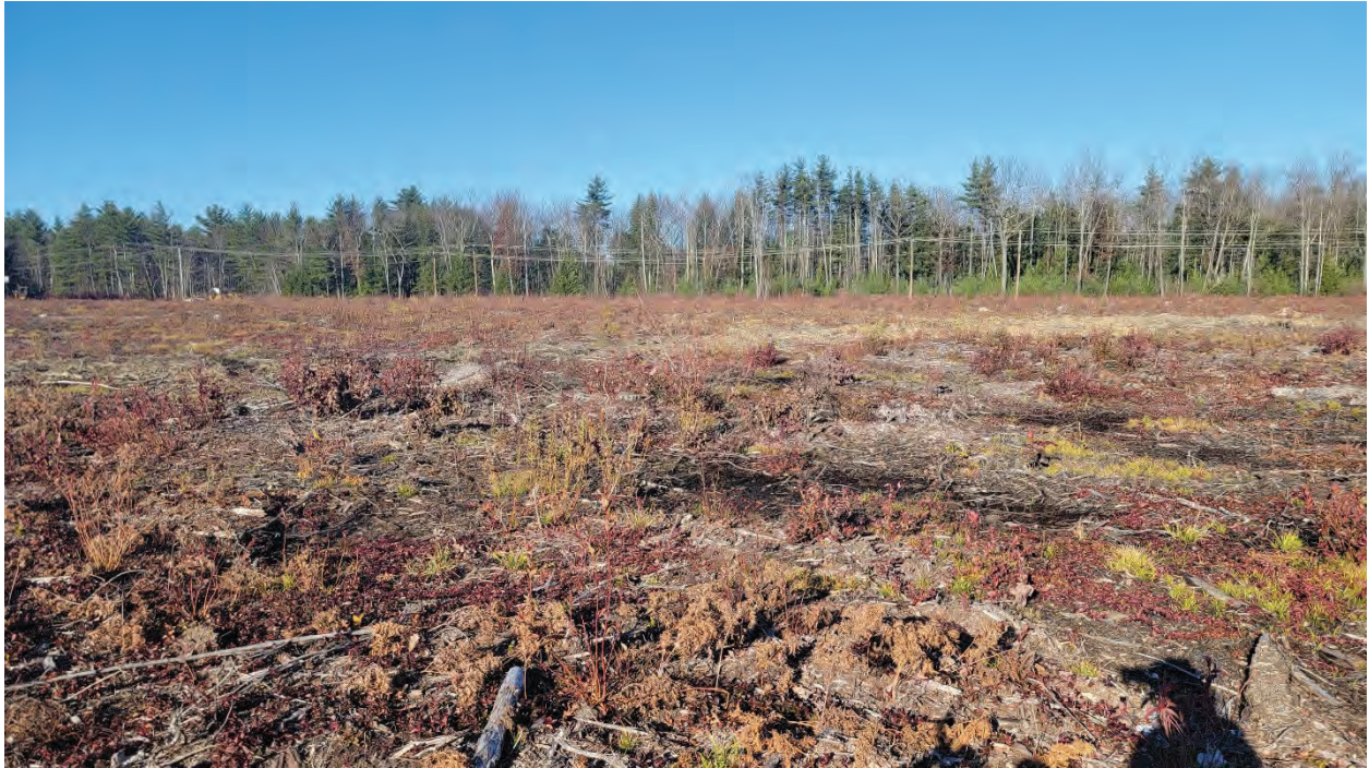
Photo 2 – Wetland Restoration Area #1 – View north into Wetland B in the center of the property (Map 240, Lot 49) where the majority of Wetland B has been disturbed and requires restoration to regrade, seed, and plant shrubs (photo taken 11/10/22).