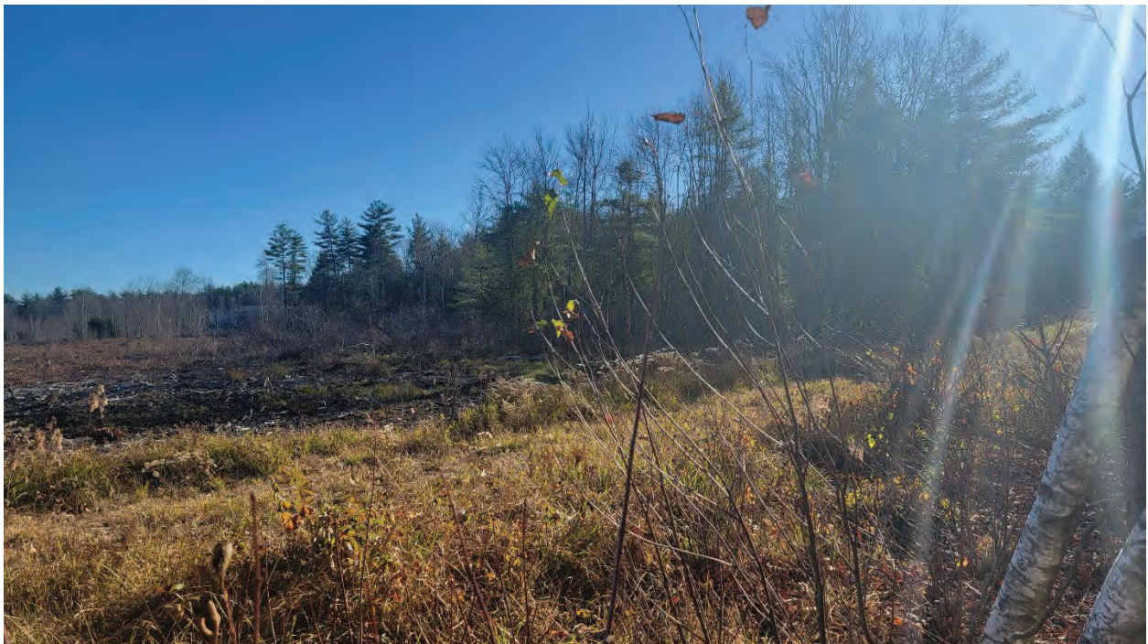
Photo 15 – Wetland Restoration Area #2 – View west across proposed Restoration Area #2 in Wetland C (photo taken 11/10/22).