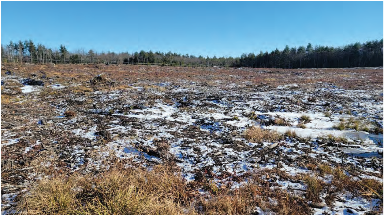
Photo 21 – Wetland Restoration Area #2 – View within Wetland Restoration Area #2 in Wetland C along impacts by forestry activities (photo taken 12/13/22).