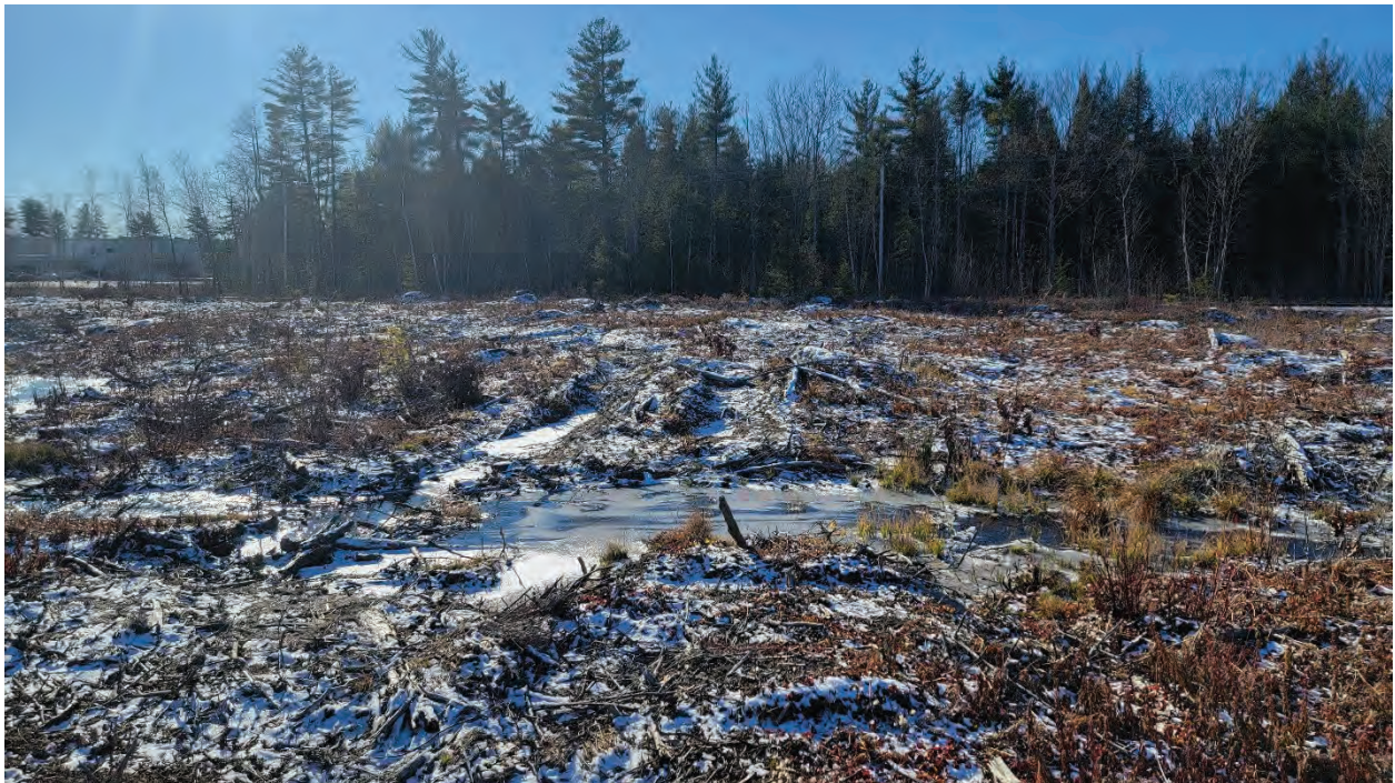
Photo17 – Wetland Restoration Area #2 – View south along proposed Wetland Restoration Area #2 Wetland C (photo taken 12/13/22).