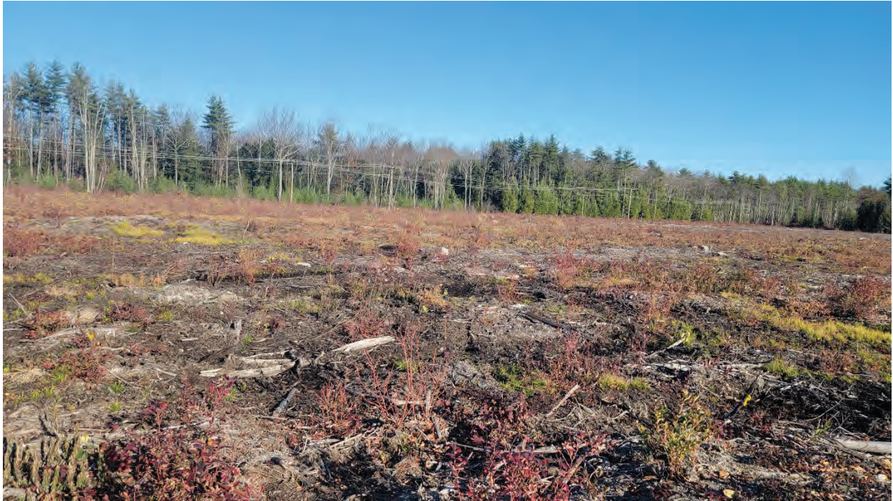
Photo 4 – Wetland Restoration Area #1 – Continued view to the northeast of disturbance of Wetland B on the property (Map 240, Lot 49) (photo taken 11/10/22).