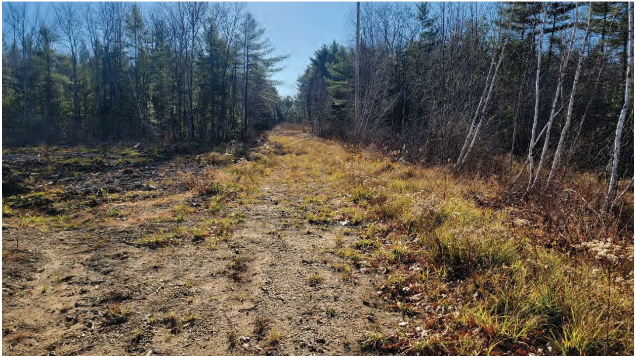
Photo 14 – Wetland Restoration Area #2 – View southwest along Shaw drive near the southwest corner of the property (Map 240, Lot 49) and across proposed Wetland Impact Area C. Restoration is proposed along the edges of Shaw Drive (Restoration Area 2) (photo taken 11/10/22).