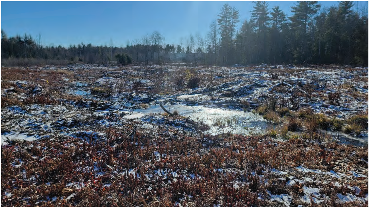
Photo19 – Wetland Restoration Area #2 – View along Wetland Restoration Area #2 in Wetland C along forestry activities (photo taken 12/13/22).