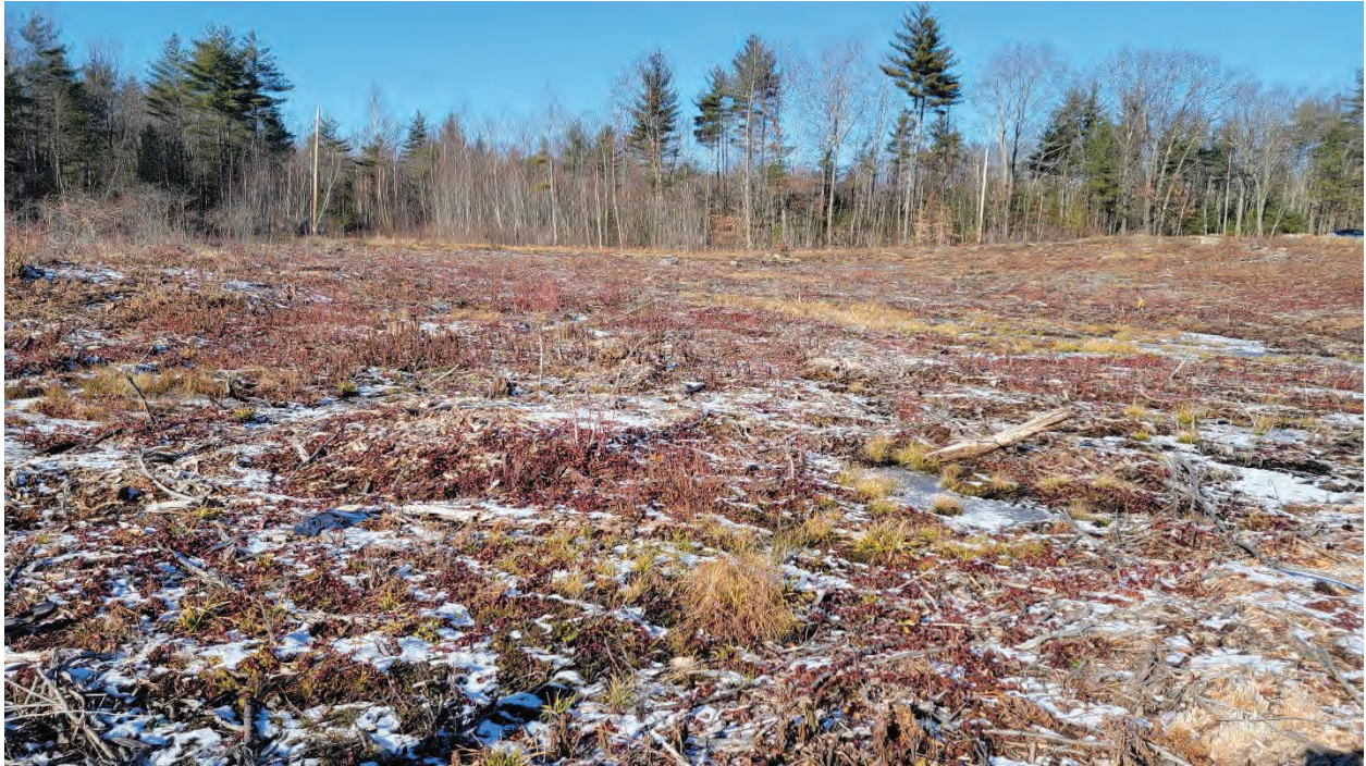
Photo 20 – Wetland Restoration Area #2 – View within Wetland Restoration Area #2 in Wetland C (photo taken 12/13/22).