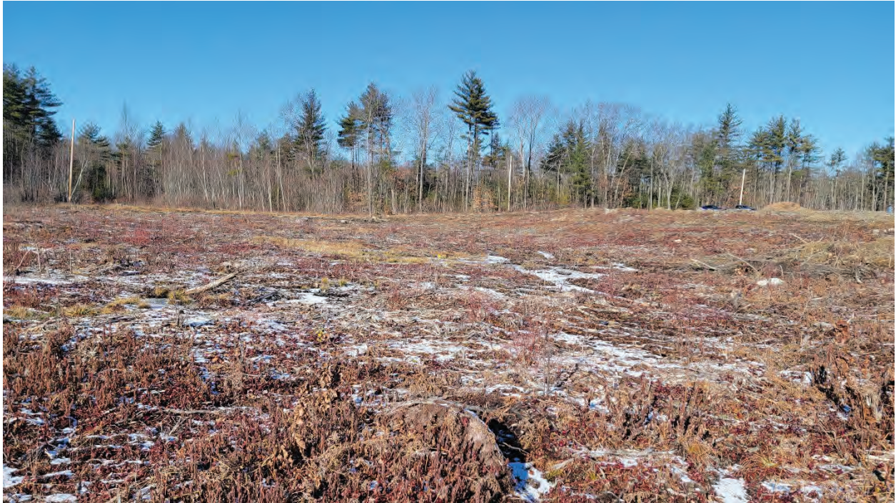
Photo18 – Wetland Restoration Area #2 – View north along proposed Wetland Restoration Area #2 (photo taken 12/13/22).