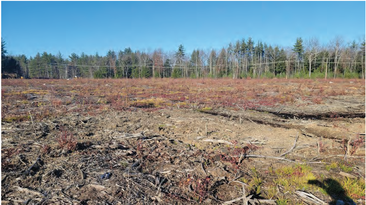
Photo 3 – Wetland Restoration Area #1 – Additional view northeast into Wetland B which has been greatly disturbed with the property (Map 240, Lot 49) (photo taken 11/10/22).