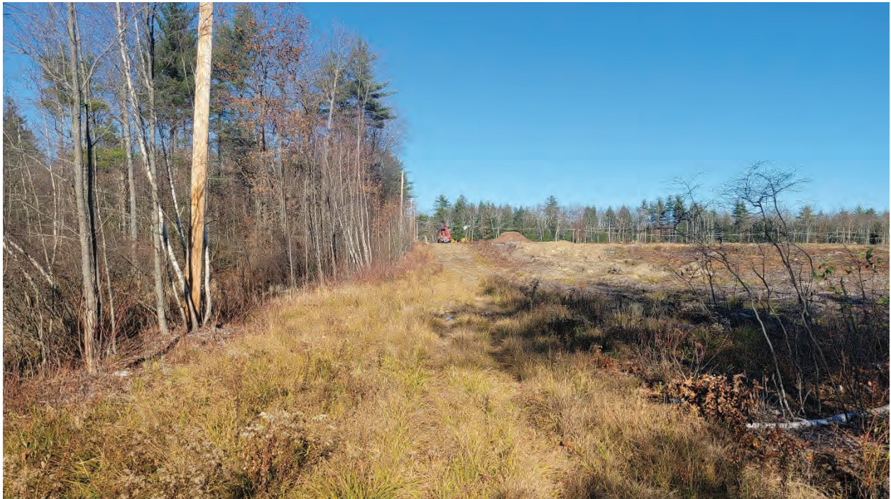
Photo 13 – Wetland Restoration Area #2 – View northeast along Shaw Drive near the southwest corner of the property (Map 240, Lot 49) and Restoration Area #2 which proposes restoration along the edges of Shaw Drive (photo taken 11/10/22).