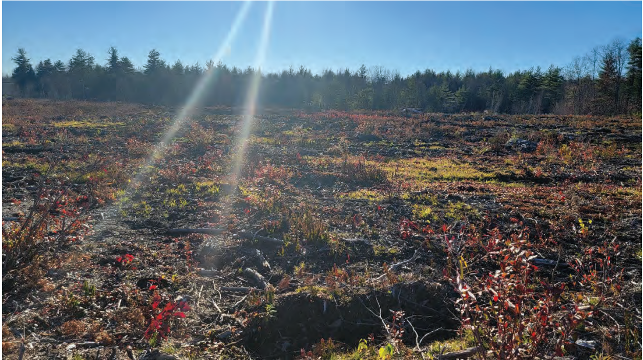
Photo 8 – Wetland Restoration Area #1 – Additional view to the south of the disturbance in Wetland B in the center of the property (Map 240, Lot 49) (photo taken 11/10/22).