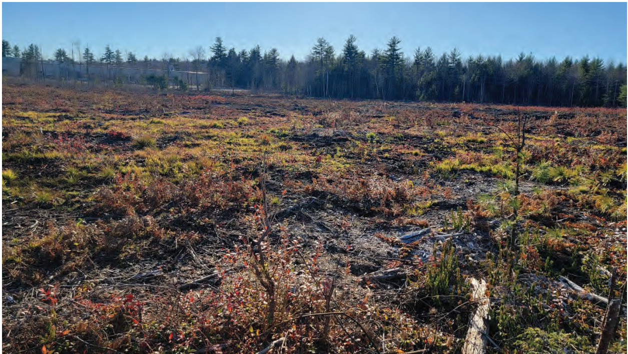
Photo 11 – Wetland Restoration Area #1 – Additional view south across wetland B disturbance (photo taken 11/10/22).