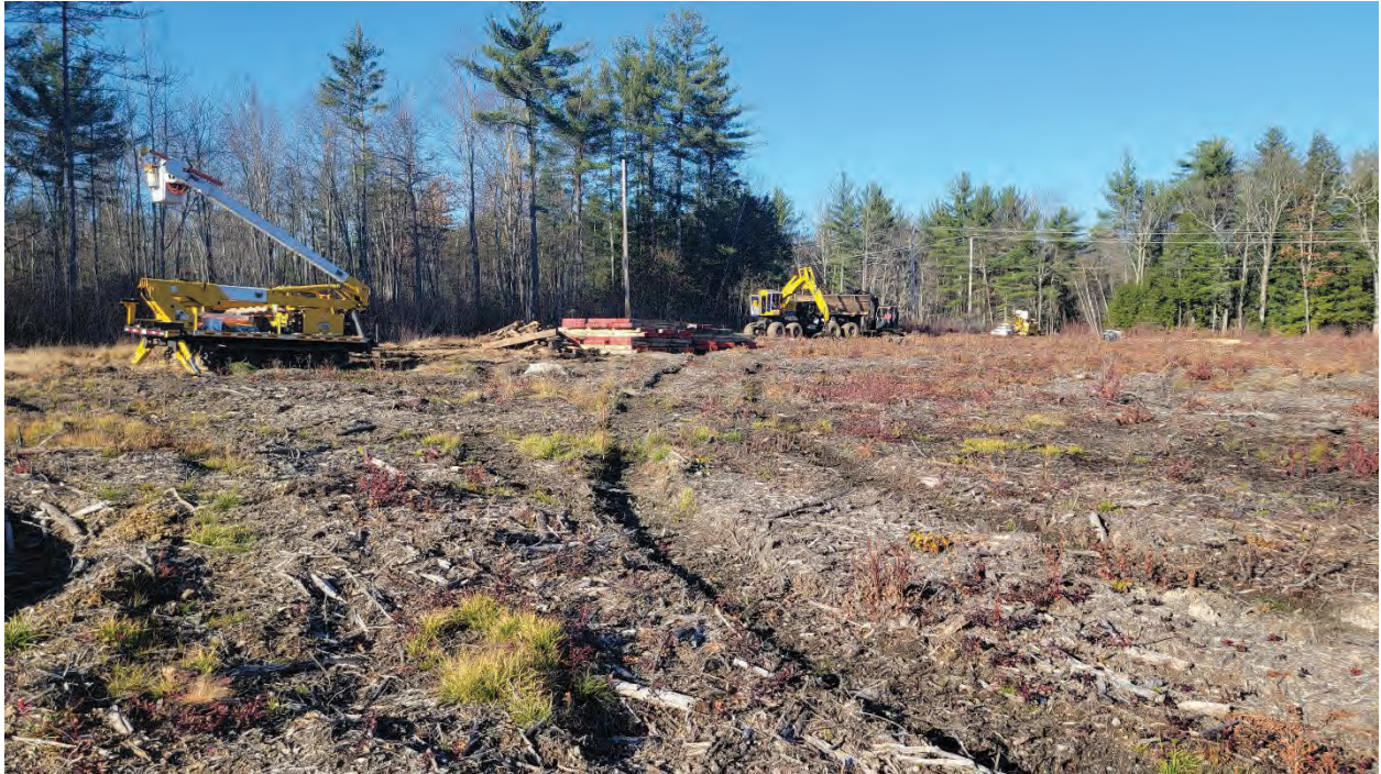
Photo 6 – Wetland Restoration Area #1 – View north along Wetland B south edge and towards proposed Wetland B impact on Shaw Drive (photo taken 11/10/22).