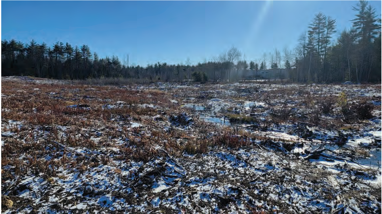
Photo 16 – Wetland Restoration Area #2 – View east across at Restoration Area # 2 in the (photo taken 12/13/22).