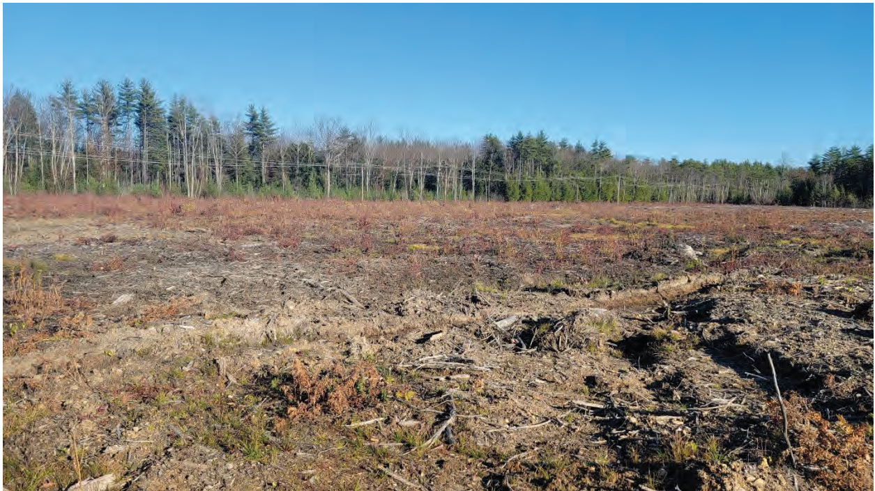
Photo 5 – Wetland Restoration Area #1 – Continued view to the northeast of disturbance of Wetland B on the property (Map 240, Lot 49) (photo taken 11/10/22).