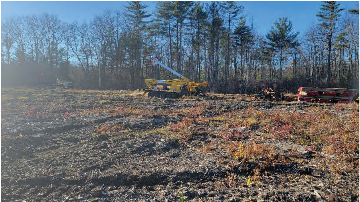
Photo 7 – Wetland Restoration Area #1 – View north along Wetland B south edge and towards proposed Wetland B impact on Shaw Drive (photo taken 11/10/22).