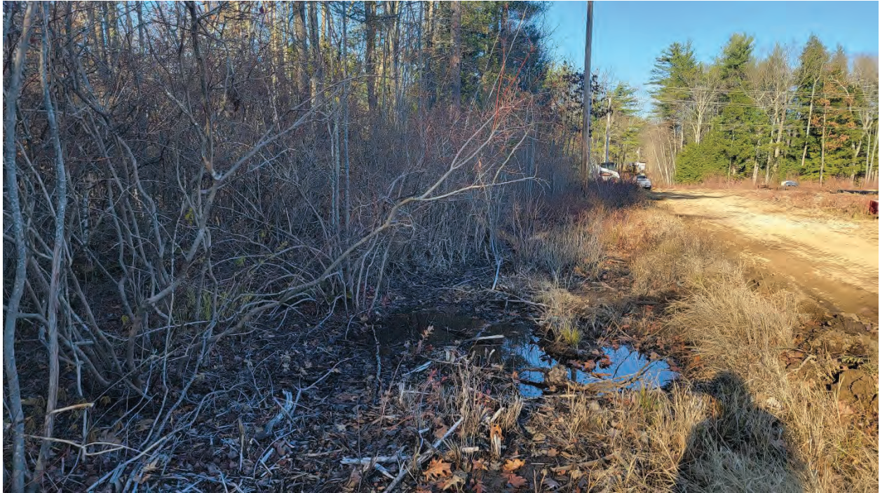
Photo 12 – Wetland Restoration Area #1 – View northeast along the west side of Shaw Drive of where restoration is proposed as part of Restoration Area #1 (photo taken 11/10/22).