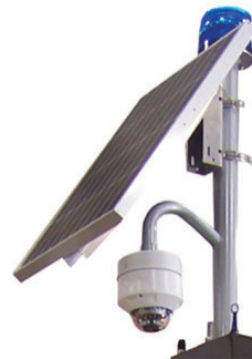
Solar Tower Pole Kit