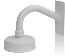
Dome Camera Mounting Bracket