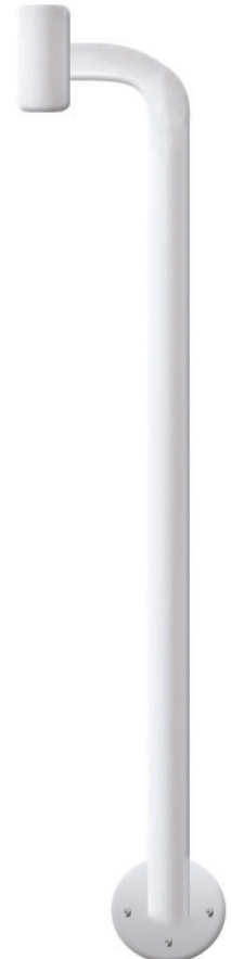
Tower Pole Kit