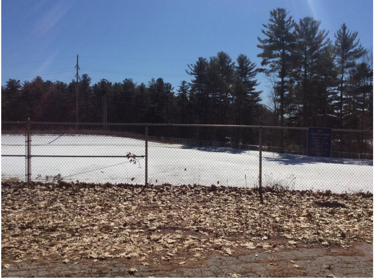
Caption: This is a view of a property adjacent to the proposed project site.