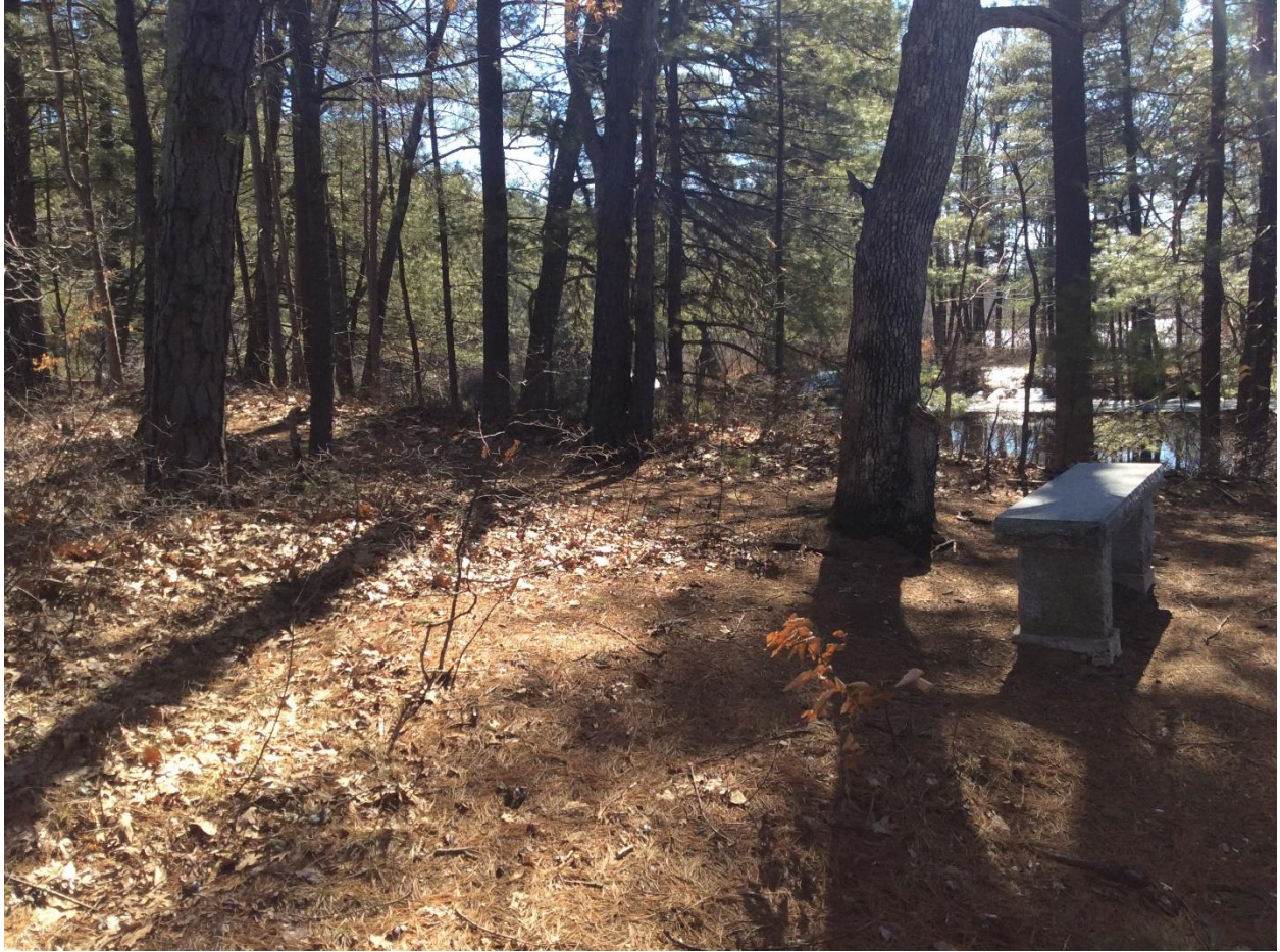
Caption: This is a view of one of a few granite benches that are located near the proposed project site.