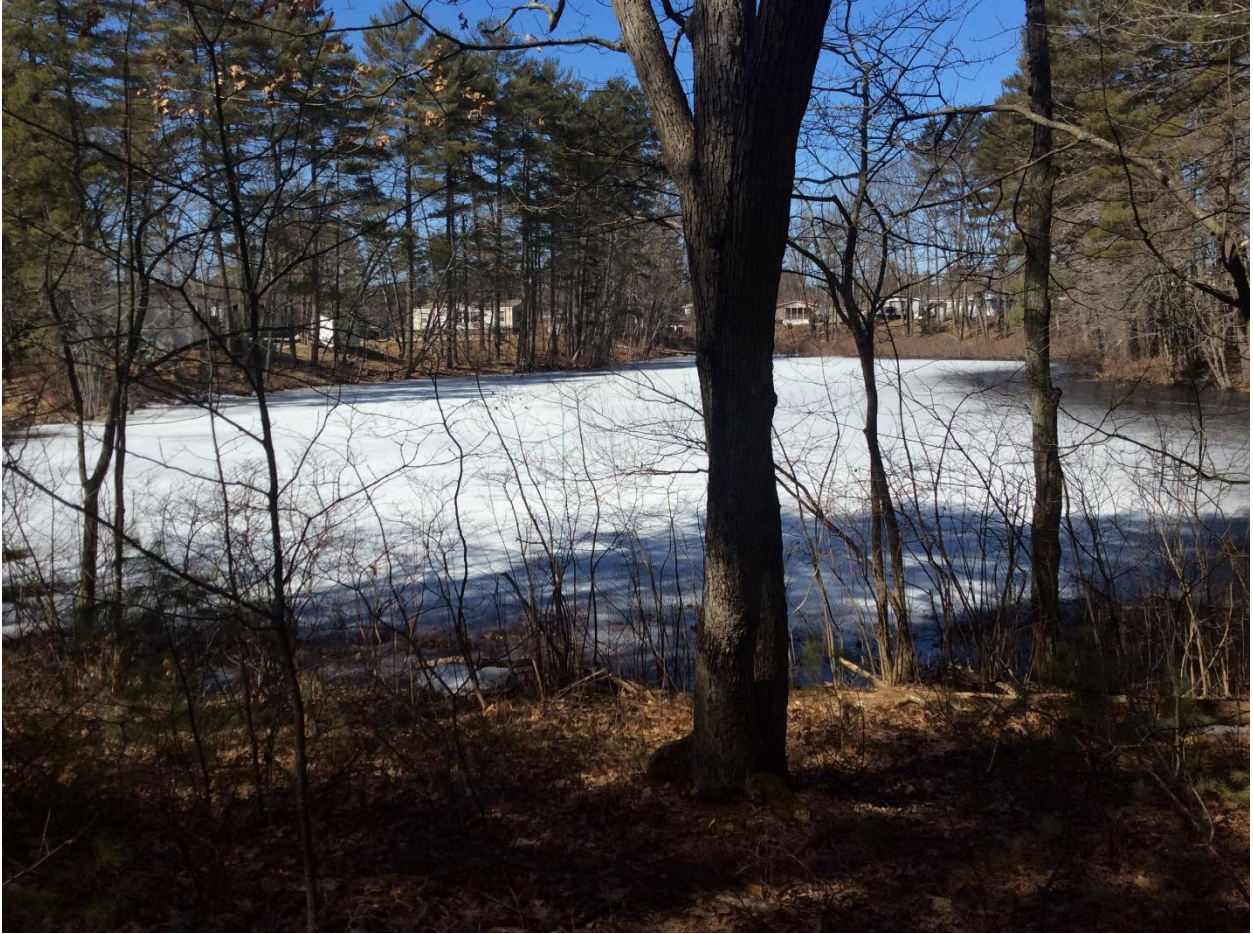
Caption: This is a view of the Cocheco River adjacent to the proposed project site.