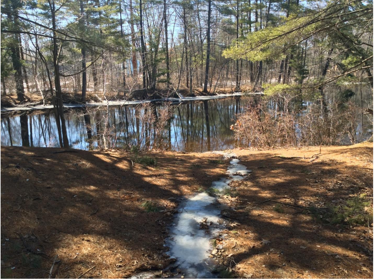
Caption: This is a view of the proposed project site along the Cocheco River.