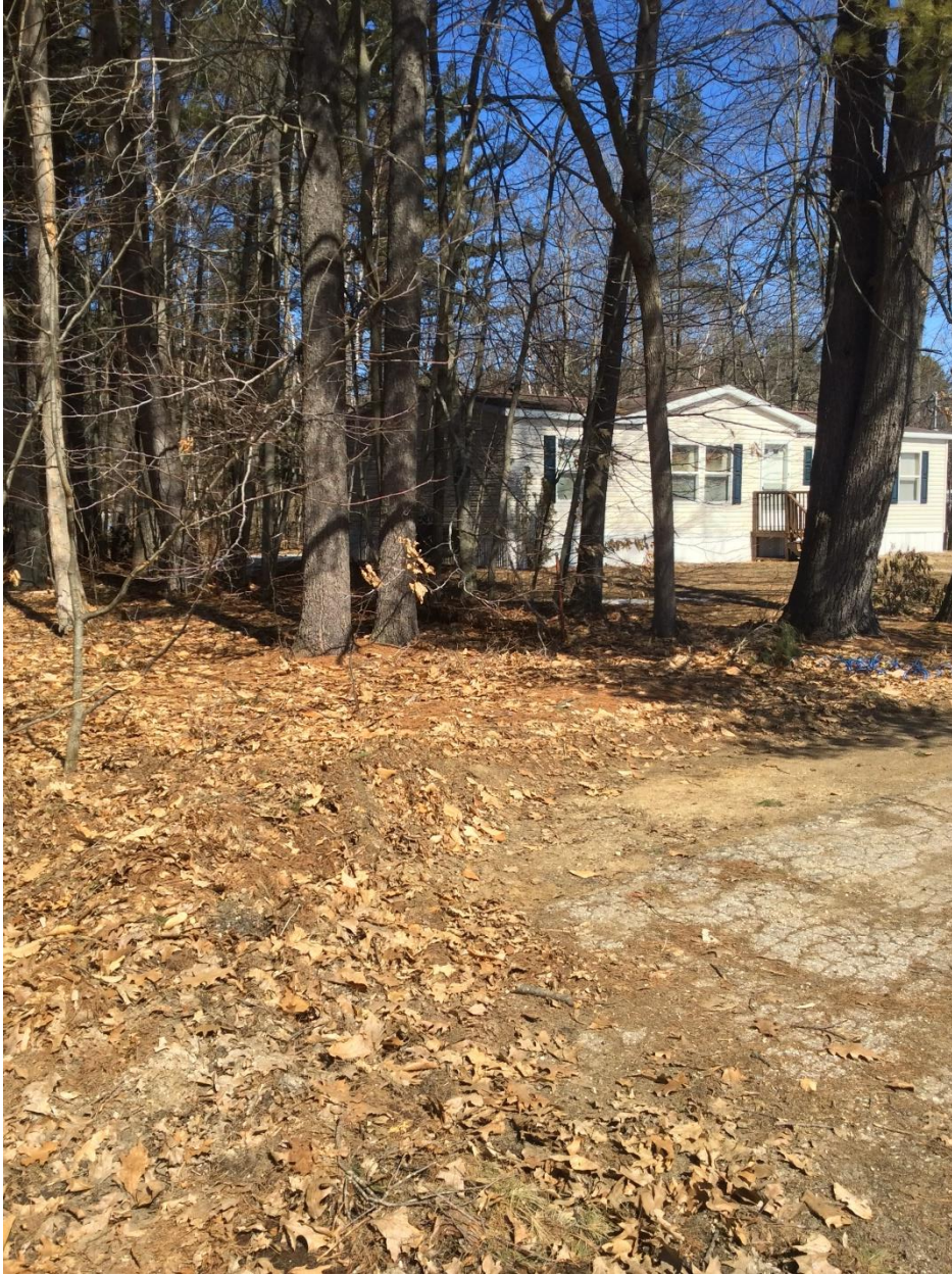
Caption: This is a view of a residential property adjacent to the proposed project site.