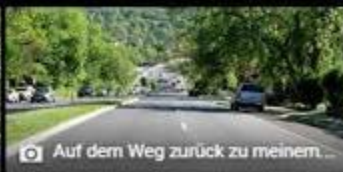
Auf dem Weg zurück zu meinem...