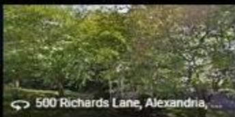
500 Richards Lane, Alexandria, ...